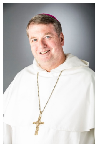
Picture: Most Reverend Anthony Fisher OP

That is the question Most Reverend Anthony Fisher OP posed to the audience at The Annual Sandra David Oration, held on Wednesday, 9 October 2013. It was a great success with over 100 attendees. The Oration was followed by the presentation of the 2013 excellence awards for clinical researchers and the announcement of the 2014 research and multi-disciplinary grant recipients.