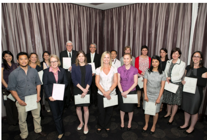
Picture: 2014 Research Grant Recipients

With the announcement of the 2014 research grants, St Vincent's Clinic Foundation has now awarded more than $11 million to over 280 research projects on the Campus. In 2014 the Trustees made $748,000 available for 12 research grants, 5 multidisciplinary research grants, 2 travelling scholarships, support for nursing and allied health staff presenting research papers and the excellence awards for clinical researchers. For full details of the grants please visit the St Vincent's Clinic website at: