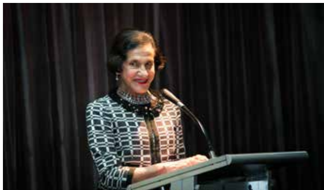
Her Excellency Professor The Honourable Dame Marie Bashir AC CVO, was the guest of honour at the 2014 St Vincent's Alumni Dinner on 30 May 2014