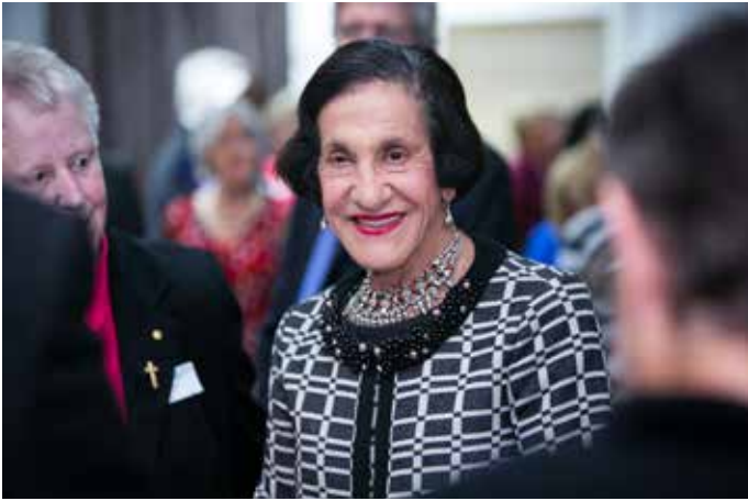
Her Excellency Professor The Honourable Dame Marie Bashir AC CVO