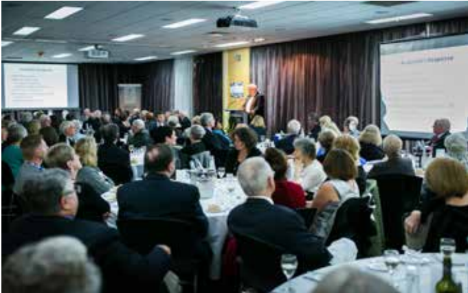
enjoying the evening