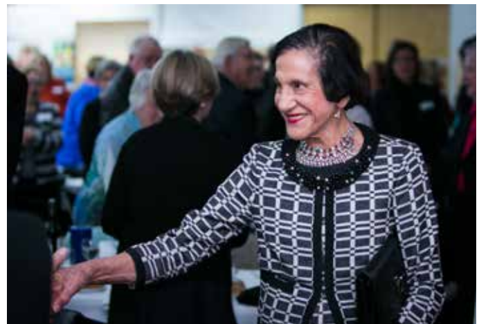
Her Excellency Professor The Honourable Dame Marie Bashir AC CVO

It was wonderful to see so many St Vincent's Alumni at the dinner and we hope to see even more of you at the next dinner which will be held on 29 May 2015. St Vincent's Clinic is most grateful to the speakers and the catering staff for their contributions to the event.