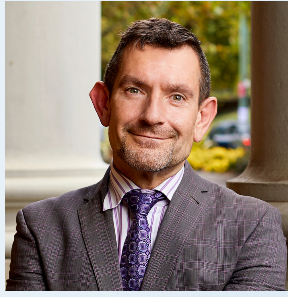
Dominic Le Lieve Integrated Care Stream