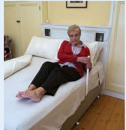
Reach for bed pole with both hands to lift from bed.