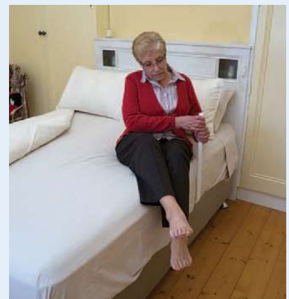
When sitting up, use bed pole to swivel to the edge of bed.